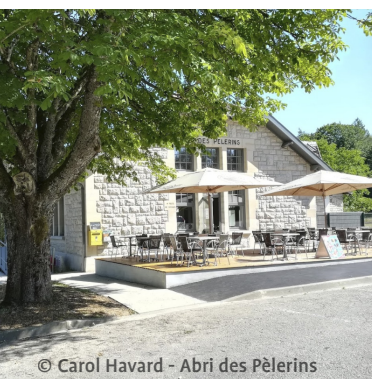
Abri des Pèlerins

Liège: "They fought for our freedom" guided tour. Based on the exploits of a World War I resistant, this tour of Liège's historic heart, the Citadel, celebrates the bravery of our soldiers and Resistance members during both world wars.