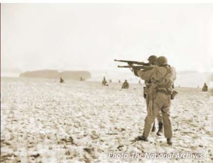
U.S. soldiers fire on German forces encircling Bastogne.